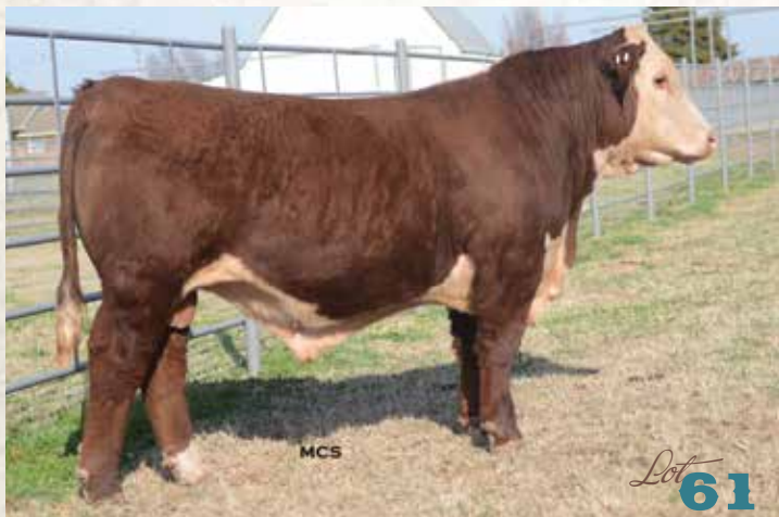
/S MANDATE 66589 ET • Sire of Lots 59 & 60