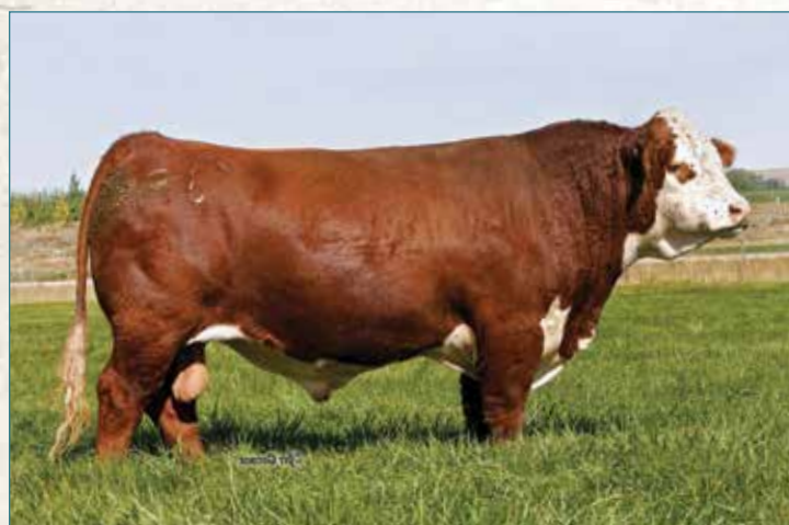
NJW 7355 M326 TRUST 100W ET • Sire of Lot 109