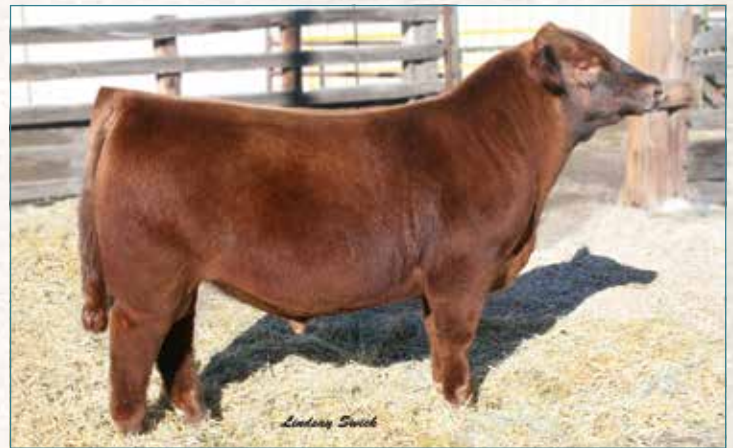
WEBR TC CARD SHARK 1015 • Sire of Lot 69