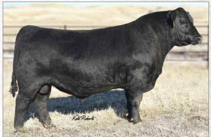
POSS ACHIEVEMENT • Sire of Lot 36