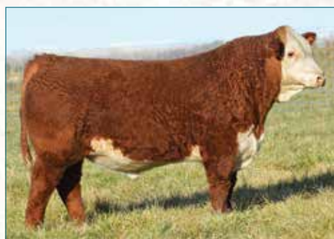
/S REVOLUTION 66128 • Sire of Lot 58