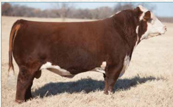
WHEELER BANSHEE B044 • Maternal sib to Lots 46 & 47, Sire of Lot 48