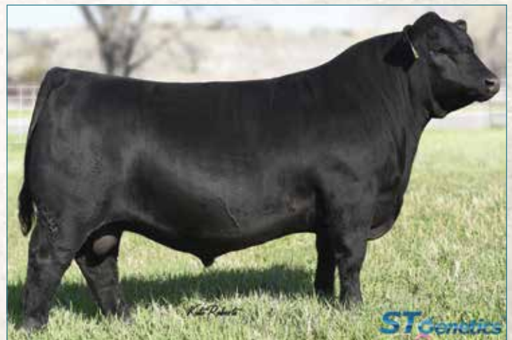
SAV RAINDANCE 6848 • Sire of Lot 37