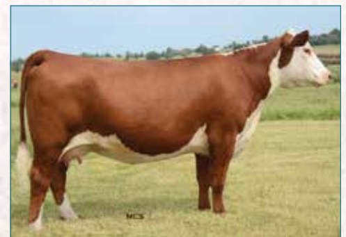
MCS U14 ROMATE 705B • Dam of Lot 56