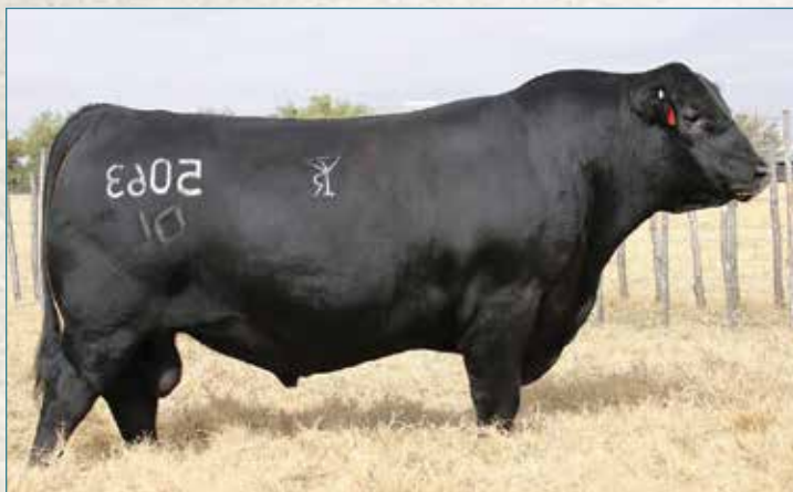
BAR R JET BLACK 5063 - Sire of Lot 12