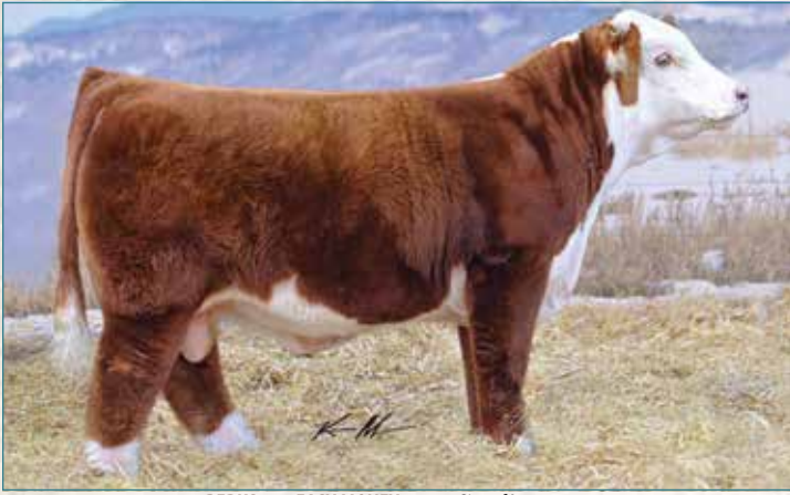
PERKS 003 EASY MONEY 4003 • Sire of Lots 51-53