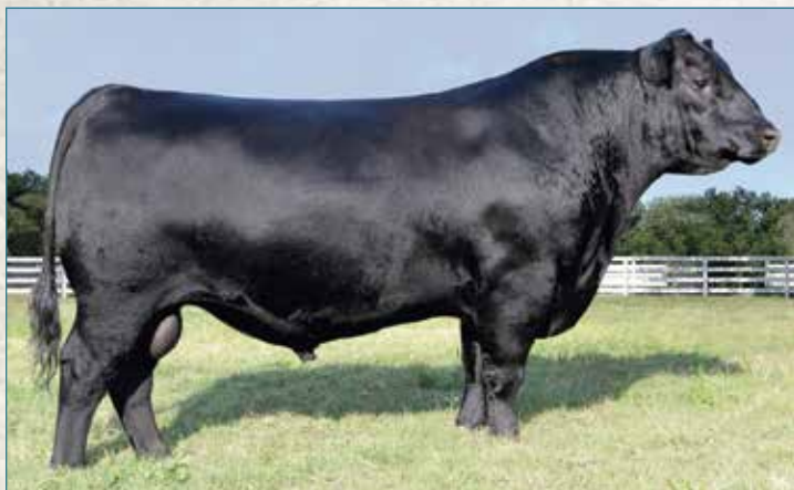
V A R GENERATION 2100 • Sire of Lot 21