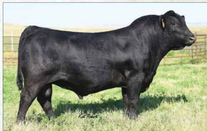
BYERGO BLACK MAGIC 3348 • Sire of Lots 1-5

• Ranks in the top 15% for Angle, Marb, and $G; top 20% for RADG and $B; top 25% for SC and $C. • Dam posts a ratio of 5@92 for BW.