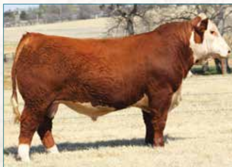
MCS 49B CONQUISTADOR 1606 • Full brother to Lot 56