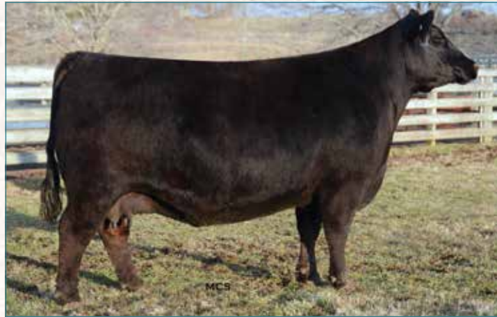
CF FLY BIS 110 The $44,000 valued top-selling Angus female in the 2015 Dixieland Delight Sale • Dam of Lots 9 & 10