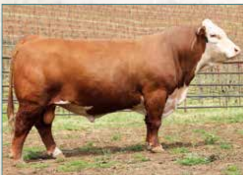
TH 512X 145Y EL DORADO 49B ET • Sire of Lot 56