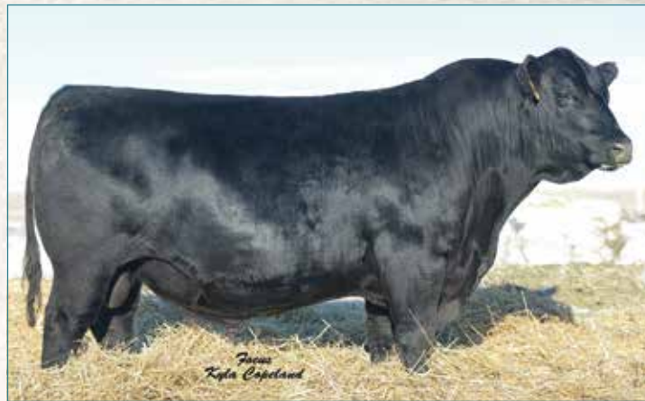
BASIN PAYWEIGHT 1682 - Sire of Lots 15-17

• Ranks in the top 2% for CEM; top 4% for $M; top 5% for $W; top 10% for Milk; top 15% for CED and $C; top 20% for BW, HP, Marb, and $G; top 25% for Angle.