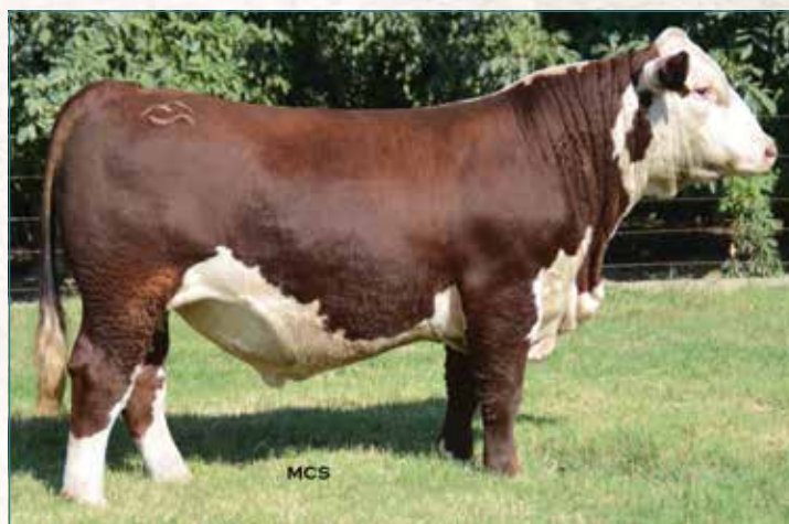
SR TKC 2018 CATAPULT 7081 ET • Sire of Lots 62 & 63