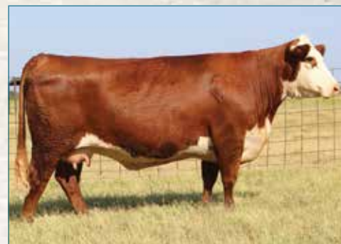
TH 60 W 17Y RUBY 404B ET • Dam of Lot 57