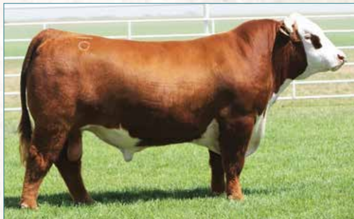
BR BELLE AIR 6011 • Sire of Lot 55