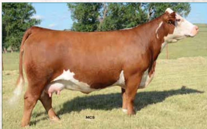
SFCC PF KNOCKOUT ROSE B418 • Dam of Lot 55