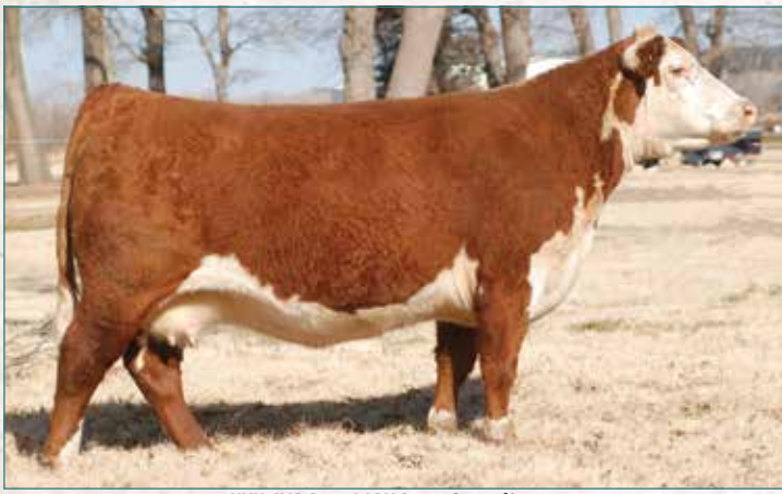
HVH CMR P606 LADY S277 • Dam of Lot 67

Bull 2/29/2020 • 44221319 • TATTOO: 2005 • POLLED RST TIMES A WASTIN 0124 GV CMR X161 TIMES UP A152 GRANDVIEW CMR MS 4003 X161 PW VICTOR BOOMER P606 HVH CMR P606 LADY S277 ET CJH L1 DOMINETTE 0064 CRR ABOUT TIME 743 RST MS 1000 BLAZER 2029 GRANDVIEW VIC H132 23G 4003 ET CMR GRANDVIEW LASS P606 425 REMITALL BOOMER 46B PW VICTORIA 964 8114 L1 DOMINO 920501 CJH L1 DOMINETTE 759 $BMI +394 $BII +457 $CHB +119 CED BW WW YW SC MILK M&G UDDR TEAT CW REA MARB $CHB -0.2 +4.1 +51 +87 +0.8 +26 +52 +1.0 +1.0 +69 +0.55 +0.04 +119 • 2005 is backed by one of the best cows in the Hereford breed in recent history. His dam is the great S277, who is a maternal sister to the legendary AI sire CJH Harland 408. She records 6@113 for WW and 40@101 for RE. This Times Up son ranks high for RE and BMI. • BW: 82 • Ranks in the top 10% for Fat; top 15% for RE; and top 25% for $BMI. • Dam posts a ratio of 6@113 for WW.